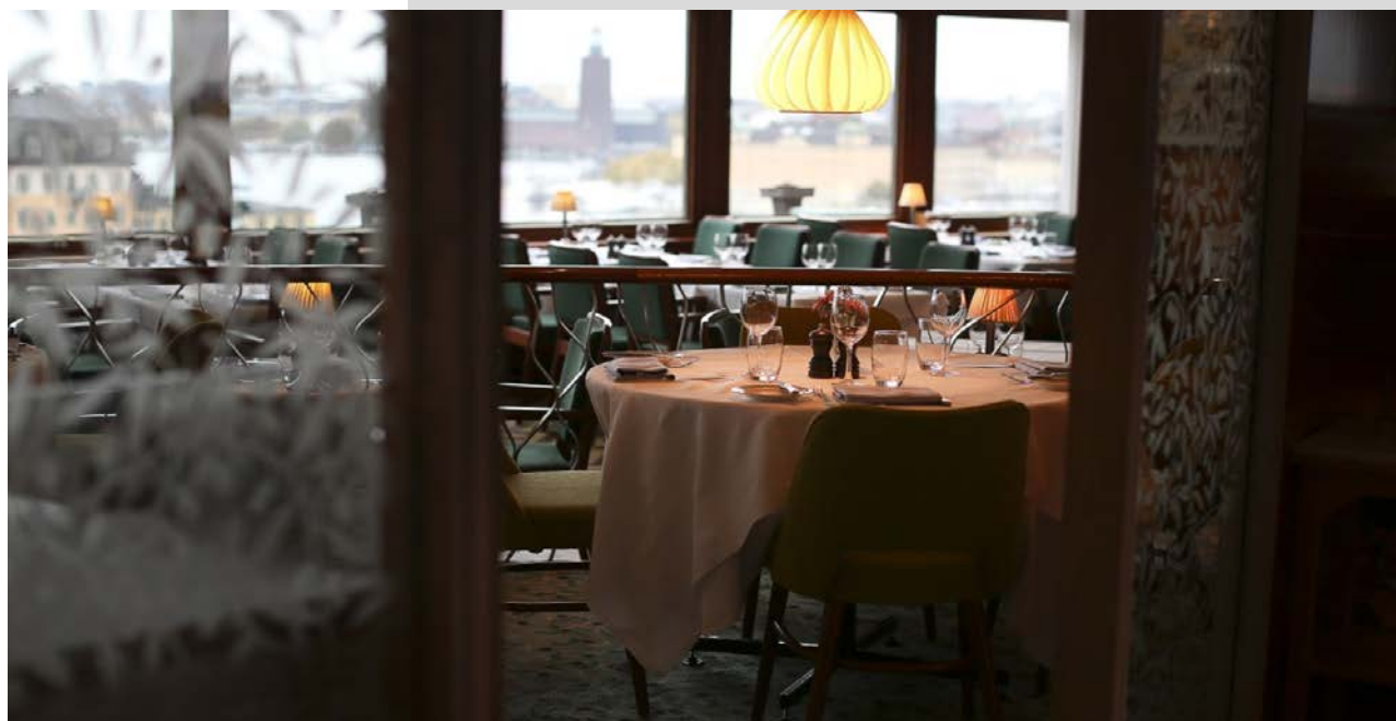
Eriks Gondolen, Stadsgården 6